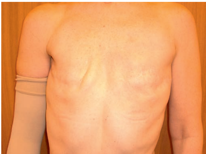
Figure 12.3 Patient is s/p bilateral mastectomy and right sided radiation. Right-sided lymphedema related to radiation and lymph node dissection is managed conservatively with compression garments.

in the affected arm such as blood pressure measurements and phlebotomy. Conservative measures such as compression stockings, and manual lymphatic drainage, suffice. Rarely, lymphatic reconstruction or bypasses can be done using microvascular techniques.