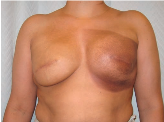
Figure 12.7 This patient underwent left modified radical mastectomy and radiation therapy with implant placement as well as right prophylactic mastectomy and implant placement. Left-sided hyperpigmentation is visible, but no capsular contracture.