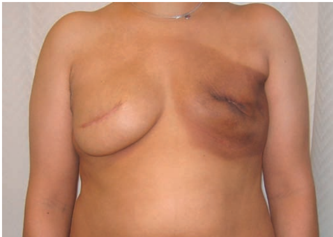
Figure 12.8 In patient shown in Figure 12.7, infection developed in the left breast requiring removal of implant. Implants have higher complication rates in the setting of radiation.