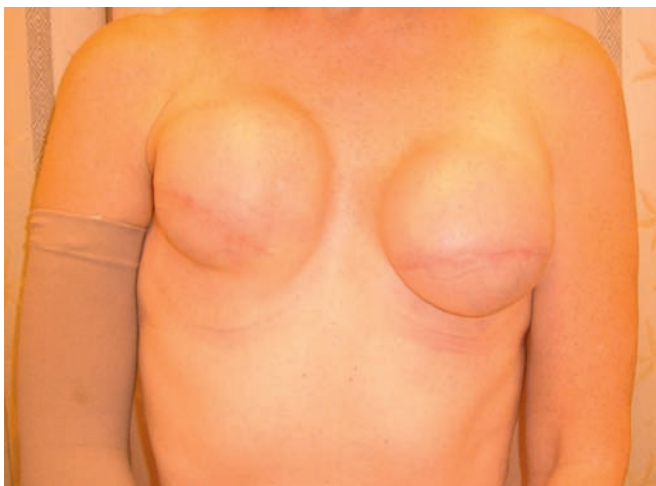
Figure 12.9 Patient shown in Figure 12.3 elected for bilateral implant based reconstruction. Note the right-sided capsular contracture in the setting of prior radiation.

may be placed in the tissue expander, and in-office serial expansions will likely be lower volume and more numerous than in a non-radiated setting.