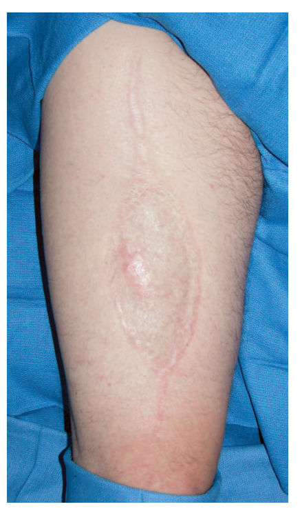
Fig. 3. Muscle bulge following approximation but not closure of the fascia lata and application of a split-thickness skin graft to the anterolateral thigh donor site.

may be performed safely without adverse clinical sequelae or increased morbidity, as defined by risk of compartment syndrome or flap failure following ipsilateral flap harvest.