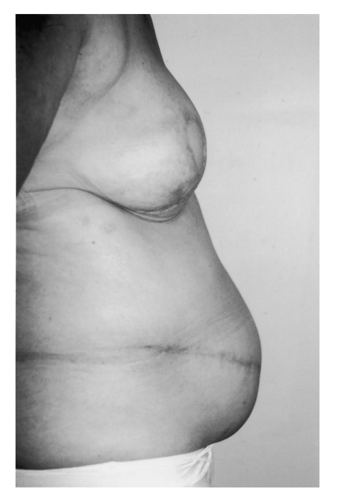
FIG. 1. Lateral view of a lower abdominal bulge after bilateral free TRAM breast reconstruction.

rience is provided to minimize variables related to the technique of flap elevation, the definition of abnormal contour, the amount of rectus abdominis removed, the innervation and vascularity of the remaining muscle segment, and the method of fascial closure.