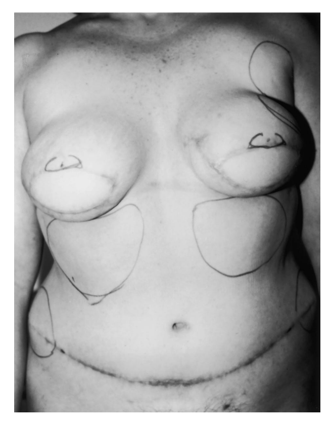
FIG. 2. Anterior view of epigastric fullness after bilateral pedicled TRAM breast reconstruction. The pedicles are tunneled ipsilaterally.

Between July of 1997 and July of 2000, 155 women underwent breast reconstruction using abdominal flaps. Breast reconstruction was unilateral in 110 women (71 percent) and bilateral in 45 women (29 percent); thus, a total of 200 flaps were used. The free TRAM was used in 108 women, pedicled TRAM flap was used in 37 women, and the DIEP flap was used in 10 women. One of the three methods of musclesparing was used in 91 women (59 percent), and non-muscle-sparing techniques were used in 64 women (41 percent). Six groups of women were analyzed; these included the unilateral free TRAM (n = 85), unilateral pedicled TRAM (n = 17), unilateral DIEP flap (n =8), bilateral free TRAM (n = 23), bilateral pedicled TRAM (n = 20), and bilateral DIEP flap (n = 2). The pedicled and free TRAM groups included both muscle-sparing and non-muscle-sparing techniques, but the DIEP flap groups included only muscle-sparing techniques (the entire muscle was preserved in all; Table I). The mean follow-up is 19.8 months (range, 6 to 42 months). Statistical analysis was completed using \chi^2 .