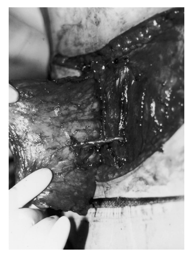
FIG. 7. Intraoperative view demonstrating DIEP flap elevation on a single perforator. No muscle is harvested.

had bilateral reconstruction in the presence of a prior midline incision. Fascial closure was completed without mesh in 12 women (80 percent) and with mesh in three women (20 percent).