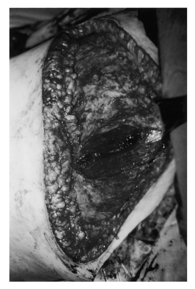
FIG. 5. Intraoperative view of the muscle-sparing, unilateral, free TRAM technique. A small central segment of the rectus abdominis muscle is harvested, thus preserving the lateral and medial segments.

women. No woman developed a hernia. \chi^2 analyses are shown in Table III.