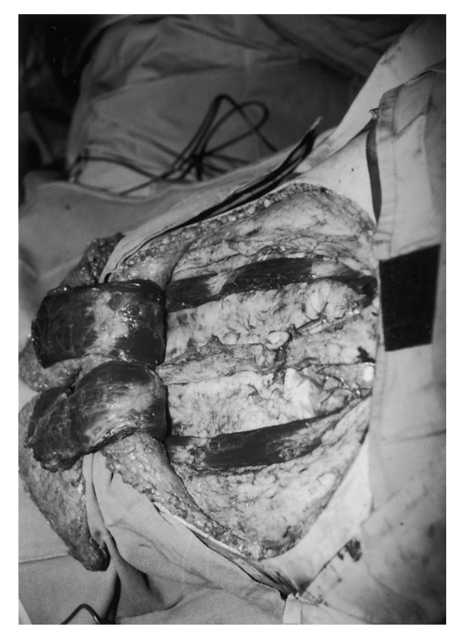
FIG. 3. Intraoperative view of the muscle-sparing, bilateral, pedicled TRAM technique.

Associated factors relevant to the analysis include patient age, tobacco use, diabetes mellitus, prior abdominal surgery, bilateral versus unilateral reconstruction, use of mesh for fascial closure, and preservation of motor innervation (Table I). Mean patient age was 48 years, with a range of 25 to 75 years. A history of tobacco use was documented in 30 women (19.4 percent). Tobacco use was defined by the consumption of more than 10 cigarettes per day. Diabetes mellitus was noted in two women