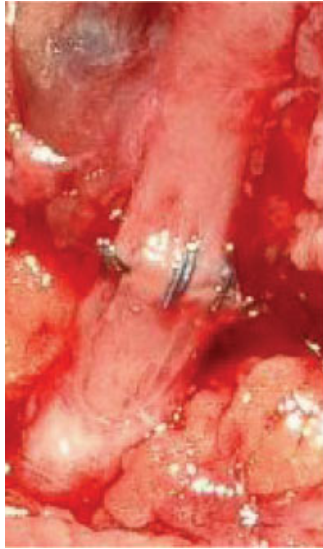
Figure 1. U-clip anastomosis of radial artery. [Color figure can be viewed in the online issue, which is available at www.interscience.wiley.com .]