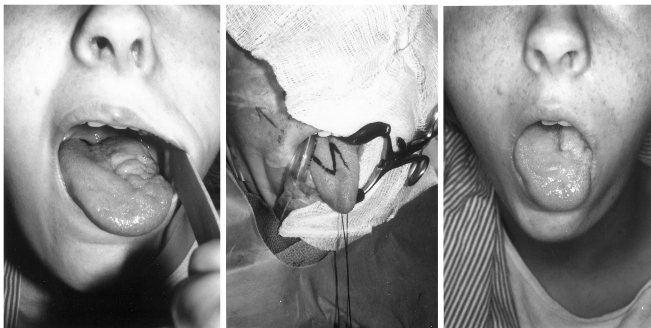
FIG. 1. Patient in case 1. (Left) Preoperatively; (center) design of flap; (right) postoperatively.