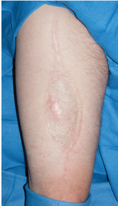
Fig. 3. Muscle bulge following approximation but not closure of the fascia lata and application of a split-thickness skin graft to the anterolateral thigh donor site.

may be performed safely without adverse clinical sequelae or increased morbidity, as defined by risk of compartment syndrome or flap failure following ipsilateral flap harvest.